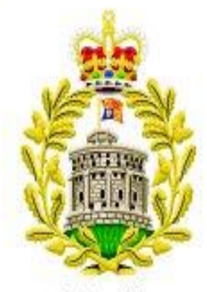
Badge of the House of Windsor