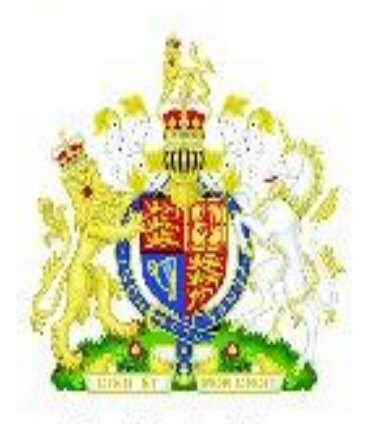
Royal Coat of Arms of the United Kingdom